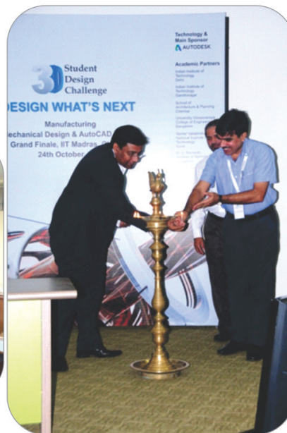
Design Contest is a nationally renowned 3D CAD competition with final event held annually at IIT Madras.